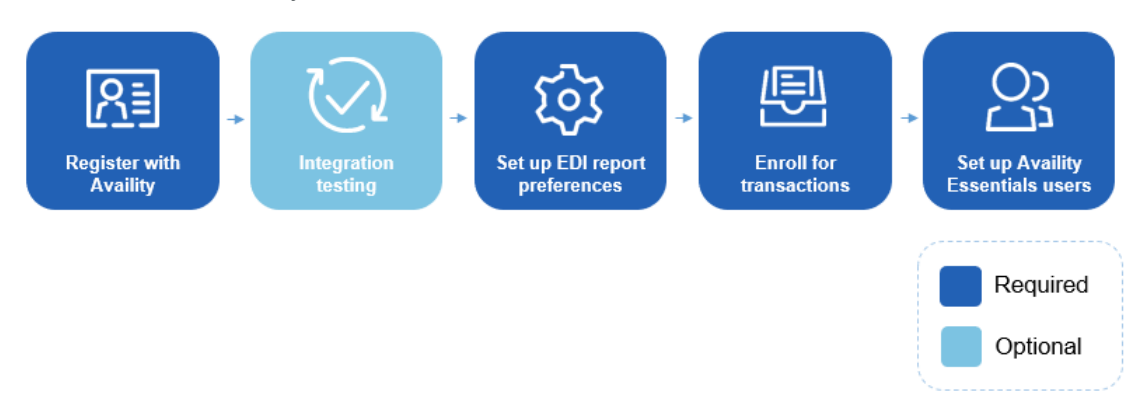
Figure 2: Setup tasks for submitting files through Availity Essentials

Note: To complete the post-registration setup steps, you'll need an Availity Essentials account. If you don't have an Availity Essentials account, contact the Availity administrator for your business and ask them to create one for you.